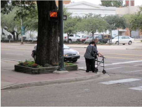
Complete Streets- Designed for all users