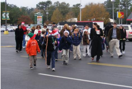
Smart Walks to School